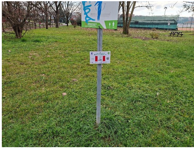
In front of us is the signpost indicating the circular route through G. Callioni Park.