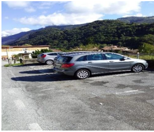
Small car park.