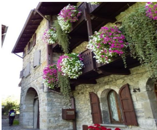
Continuing on to the village of Oneta we encounter a typical local house.