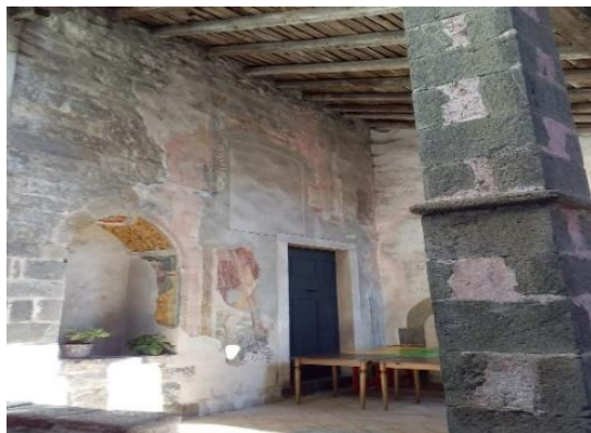
We reach the little church of the Carmine on whose outer wall a large Saint Christopher, along with other saints, protected travellers travelling along the Via Mercatorum, the oldest road in the Brembana Valley.