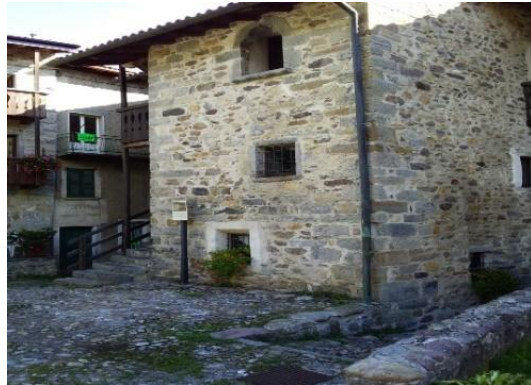
On reaching the small square below, we encounter the 15th-century stately building known as "Harlequin's House".