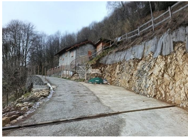
We pass some building work on a house on our right.