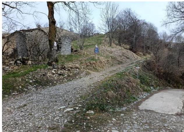
We turn right onto the path that will take us to Passo del Palio.