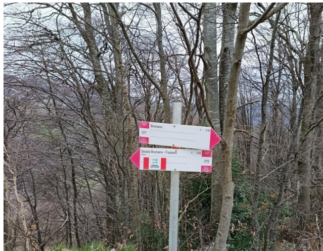
A signpost indicates that two CAI paths, 577 and 578, intersect here.