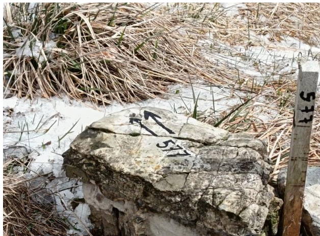
During the descent from the Passo del Palio, at the junction, we put up a makeshift sign indicating 577.