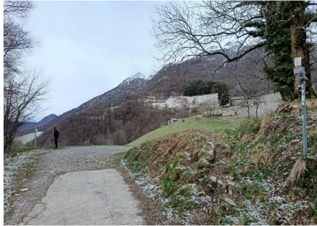
We reach a junction between a path climbing up from Brumano and the road to the Resegone Refuge.